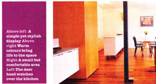
Above left A simple yet stylish display Above right Warm colours bring life to the space Right A small but comfortable area Left The deer head watches over the kitchen