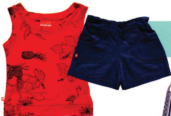
Short Shorts $38 and Mywaikiki Girl Top $34 (www.knufflekid.com)