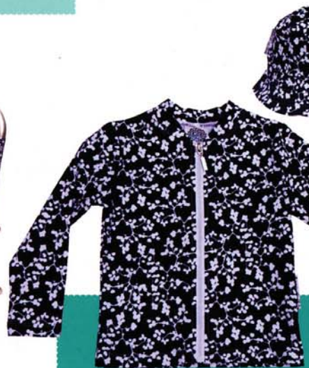
Hayman Beach Seat $59.95 (www.sunnylife.com.au), Blossom Hat $16 and Rashie $39 (www.babesintheshade.com.au)