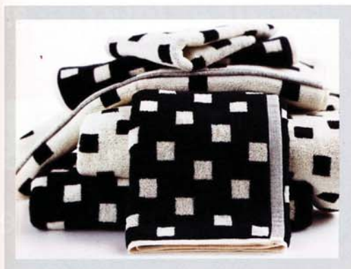
Square in ebony sable - bath towel, hand towel, face cloth and bath mat