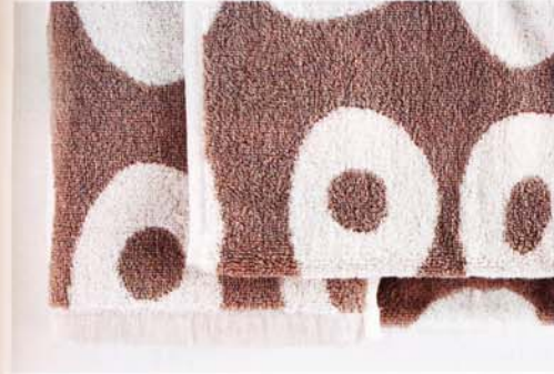
Circle in taupe/eggshell. Bath towel, hand towel and face cloth

Bring an architectural palette to your bathroom with these graphic, textured towels designed by Katarina Bijlsma for the Cool Galah Towel Collection. For a stylish statement use white on white or black on white or, if an earthy palette is more to your liking, mix and match your patterns using circles, herringbone, stripes and tweed for some textural diversity. Distributed by Linen & Moore (visit linenmoore.com.au for list of Queensland stockists). Or purchase online at www.coolgalah.com.au