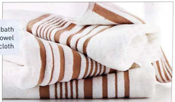
Beige stripe bath towel, hand towel and face cloth

Available at David Jones stores nationally and all leading homewares stores.