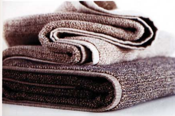
Light and dark textured tweed - bath towel, hand towel, face cloth and bath mat