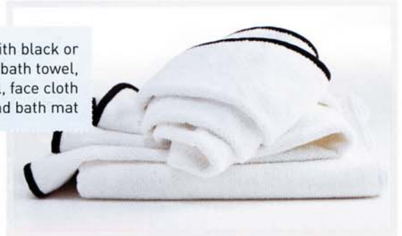
Jacquard with black or white trim - bath towel, hand towel, face cloth and bath mat