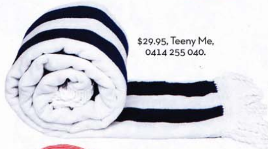
$29.95, Teeny Me, 0414 255 040.