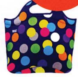
$79.95, Built NY from Until, (02) 9690 0016, shop.until.com.au.