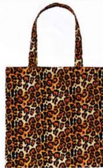
$24.95, Urban Originals, (02) 9938 3874, uo.com.au.