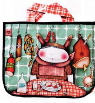
$54.95, Rudy and the Dodo, 0438 217 108, rudyandthedodo.com.au.