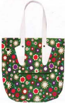
$59.95, Paul Frank, 1800 132 780.