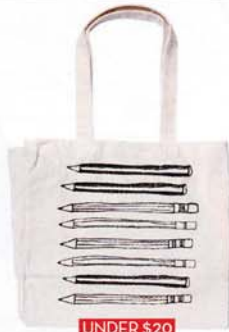
UNDER $20 $9.95, Kikki.K, (03) 9645 6346, kikki-k.com.