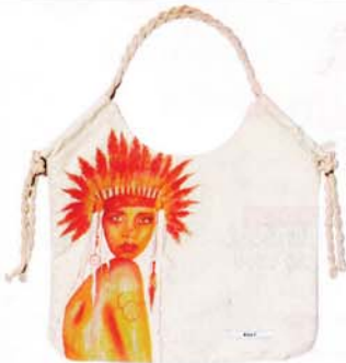
$55.99, Roxy, 1800 805 506.