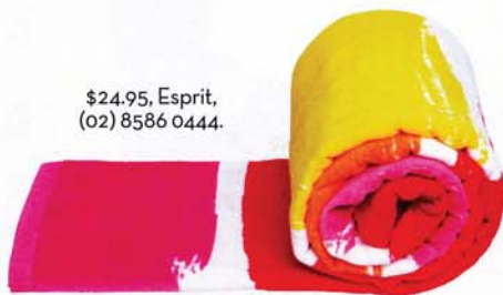
$24.95, Esprit, (02) 8586 0444.