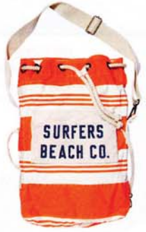
$39.95, Country Road, 1800 801 911, countryroad.com.au.