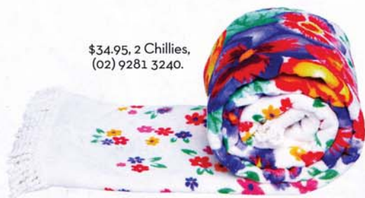
$34.95, 2 Chillies, (02) 9281 3240.