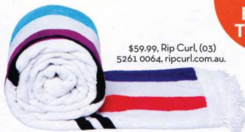
$59.99, Rip Curl, (03) 5261 0064, ripcurl.com.au.