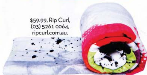
$59.99, Rip Curl, (03) 5261 0064, ripcurl.com.au.