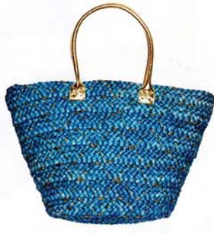
$24.99, Missco from Bag Sac Design, (02) 9697 0577, bagsac.com.au.