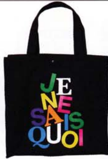
$89, Chip Chop!, (03) 8060 7313, chipchop.com.au.