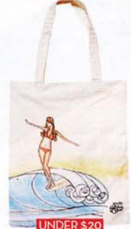
UNDER $20 $19.99, Rip Curl (03) 5261 0064, ripcurl.com.au.