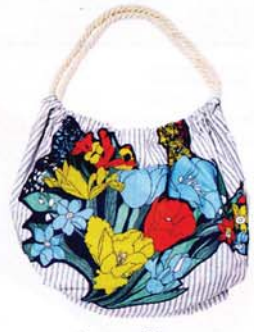
$79.95, Fiona, (03) 9827 8002, fionaonline.com.au.