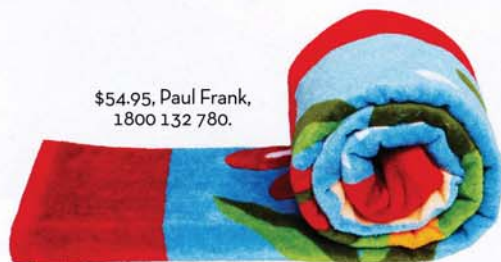
$54.95, Paul Frank, 1800 132 780.