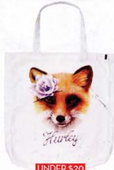
UNDER $20 $19.99, Hurley, 1300 139 719.