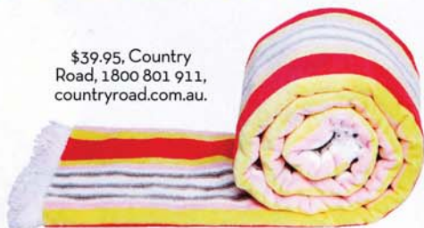
$39.95, Country Road, 1800 801 911, countryroad.com.au.