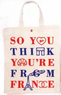
$69, Chip Chop!, (03) 8060 7313, chipchop.com.au.