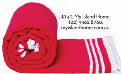
$140, My Island Home, (02) 9362 8760, myislandhome.com.au.