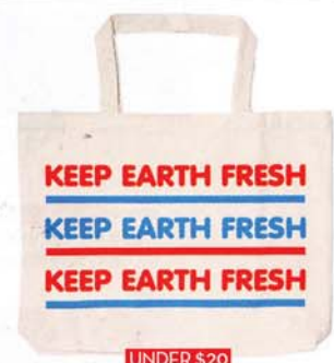
UNDER $20 $9.95, MMMG from Notemaker, (03) 9329 3717, notemaker.com.au.