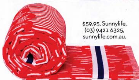
$59.95, Sunnlylife, (03) 9421 6325, sunnlylife.com.au.