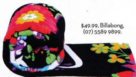
$49.99, Billabong, (07) 5589 9899.