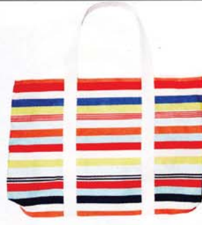
$59.95, Sunnlyfe, (03) 9421 6325, sunnlyfe.com.au.