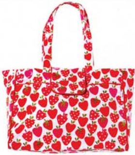
$75, Pretty In Pink, (02) 9516 2331, prettyinpink.com.au.