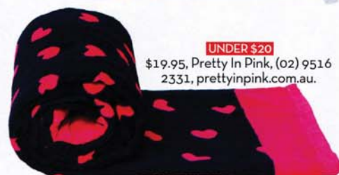
UNDER $20 $19.95, Pretty In Pink, (02) 9516 2331, prettyinpink.com.au.