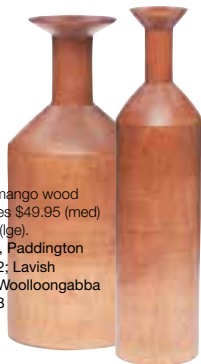
SunnyLIFE mango wood cylinder vases $49.95 (med) and $59.95 (lge). Olive Home, Paddington p 3367 0792; Lavish Essentials, Woolloongabba p 3391 0108