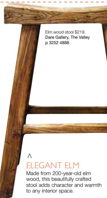
Elm wood stool $219. Dare Gallery, The Valley p 3252 4888