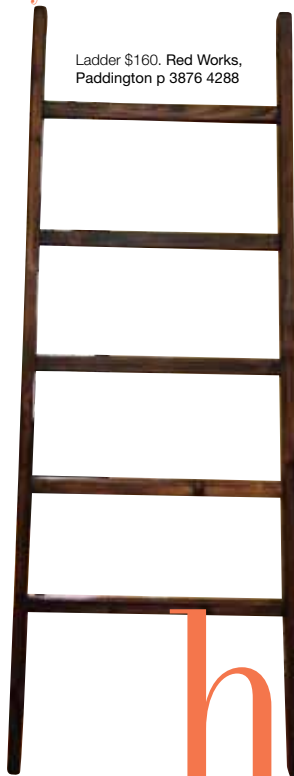
Ladder $160. Red Works, Paddington p 3876 4288