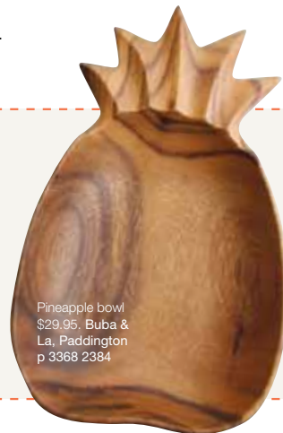
Pineapple bowl $29.95. Buba & La, Paddington p 3368 2384

The silky-smooth finish, quirky shape and gorgeous wood grain make this bowl the pick of the bunch.