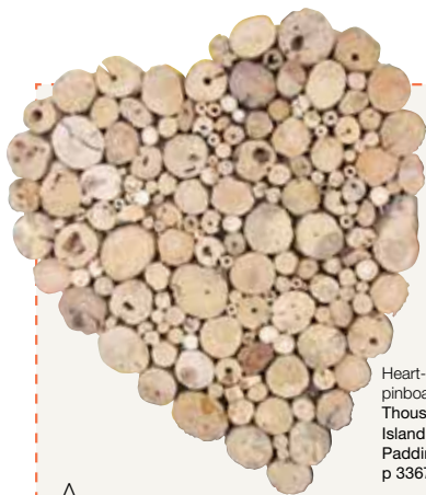
Heart-shaped pinboard $45. Thousand Island Dressing, Paddington p 3367 8288