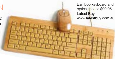
Bamboo keyboard and optical mouse $99.95. Latest Buy www.latestbuy.com.au