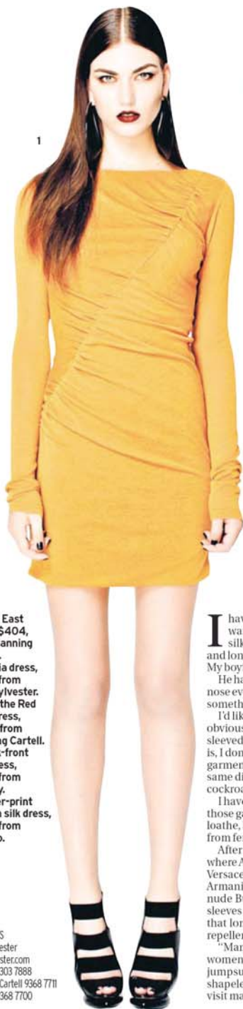
1. Road East dress, $404, from Manning Cartell. 2. Gloria dress, $365, from Kate Sylvester. 3. Erik the Red maxi dress, $604, from Manning Cartell. 4. Tuck-front lace dress, $699, from Thurley. 5. Laser-print stretch silk dress, $989, from Lisa Ho.

STOCKISTS Kate Sylvester katesylvester.com Lisa Ho 8303 7888 Manning Cartell 9368 7711 Thurley 9368 7700