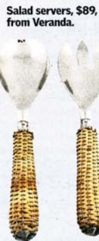
Salad servers, $89, from Veranda.