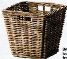
Byholma basket, $24.95, from Ikea.

Top-bottom: Hayman and Byron throw cushions, $44.95 each, and Avalon and Balmain floor cushions, $79.95 each, all by SunnyLife.