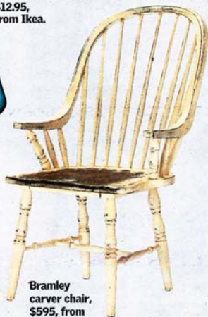
Bramley carver chair, $595, from Laura Ashley.