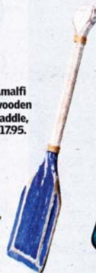
Amalfi wooden paddle, $17.95.