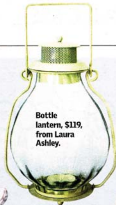
Bottle lantern, $119, from Laura Ashley.