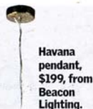
Havana pendant, $199, from Beacon Lighting.