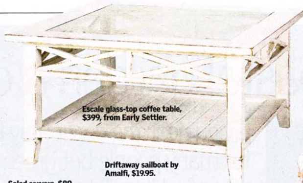
Escale glass-top coffee table, $399, from Early Settler.