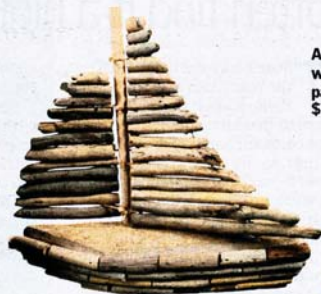
Driftway sailboat by Amalfi, $19.95.