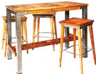
Pahu recycled teak outdoor bar, $799, and stools, $229 each, from Vast Interior, Joondalup, 9300 9960, Nedlands, 9389 1740, and Port Kennedy, 9524 5093.