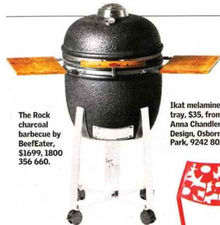
The Rock charcoal barbecue by BeefEater, $1699, 1800 356 660.