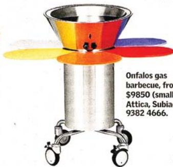
Onfalos gas barbecue, from $9850 (small), from Attica, Subiaco, 9382 4666.