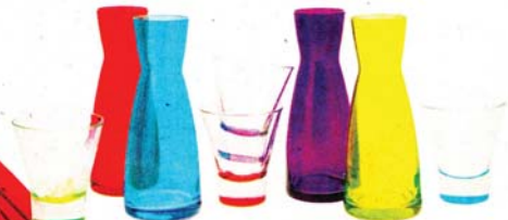
Ypsilon carafes, $12.99 each, and Ypsilon Pre-Dinner glasses, $29.95 (set of four), all by Bormioli from Kitchen Warehouse stores.