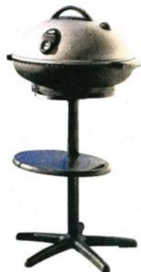
Kettle King HG6600B electric barbecue by Sunbeam, $299, 1300 881 861.