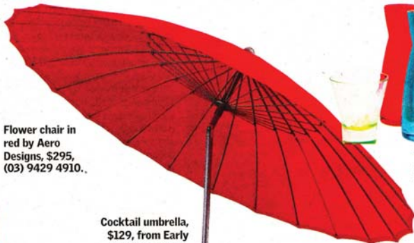
Cocktail umbrella, $129, from Early Settler, Innaloo, 9445 1911.