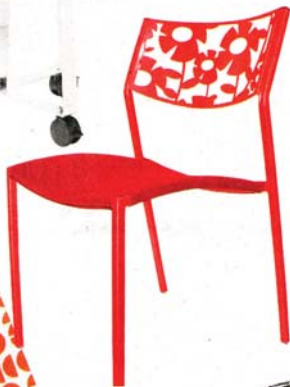
Flower chair in red by Aero Designs, $295, (03) 9429 4910.