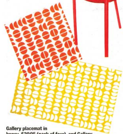
Gallery placemat in honey, $29.95 (pack of four), and Gallery cocktail napkin in ginger, $24.95 (pack of four), all by Aura by Tracie Ellis from www.aurahome.com.au.