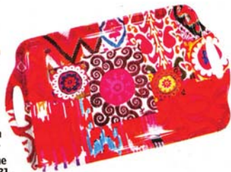
Ikat melamine tray, $35, from Anna Chandler Design, Osborne Park, 9242 8031.