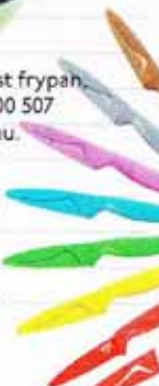
Kuhn Rikon 'Colori' knives, $15.50/each, VGM, 1800 650 601.