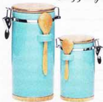
Kitchen canisters in Turquoise, $29.95/large, $24.95/small, SunnysLife, (03) 9421 6325, sunnyslife.com.au .