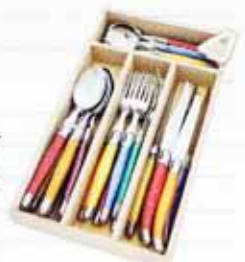
Lagulole 'Debutant' mixed colour cutlery, $295.95/24-piece set, VGM, 1800 650 601.