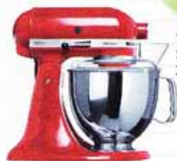
'KSM150' stand mixer in Red, $795, KitchenAid, 1800 990 990, kitchenaid.com.au .