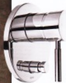
Stylish simplicity Raymor "Torino" bath & shower mixer, $249.

TAKING ITS CUES from a traditional Turkish bathhouse , this room features an exquisite mosaic bath. The style may be ancient, but the colour scheme is bang up to date, with the zinc-hued wall and black concrete floor reflected in the monochrome tiles . The timber bench has more of a Scandinavian-sauna feel, but in this modern adaptation, it makes perfect sense. 1