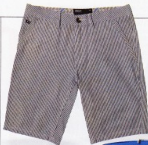
Oakley shorts, $89.95.