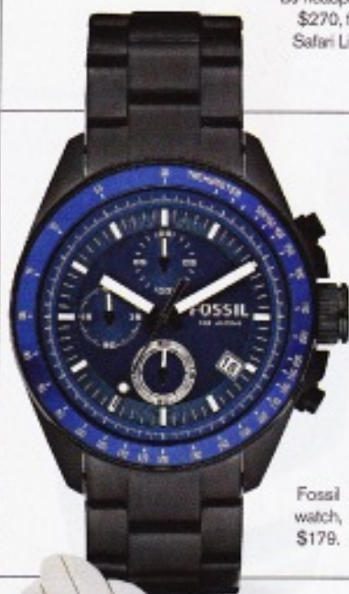
Fossil watch, $179.