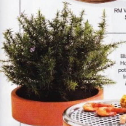
Black + Blum Hot Pot (plant pot/grill), $199, from Bristol & Brooks.