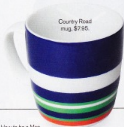
Country Road mug, $7.95.