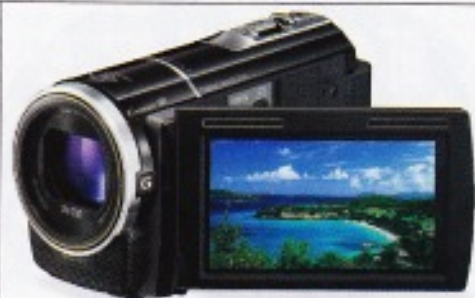
Sony HDR PJ10 Projector Handycam camcorder, $999.