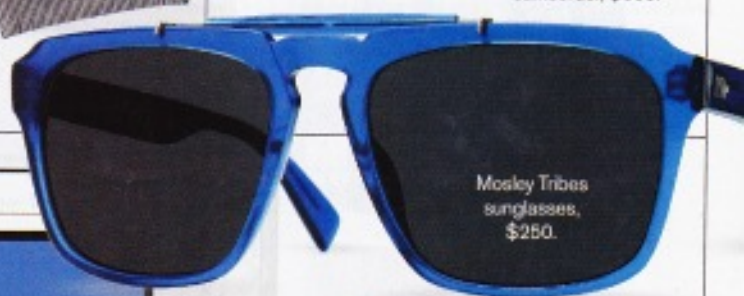
Mosley Tribes sunglasses, $250.