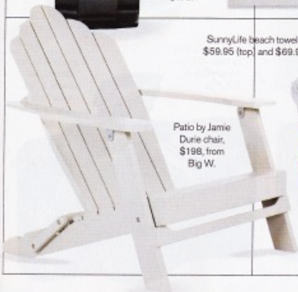
Patio by Jamie Durie chair, $198, from Big W.