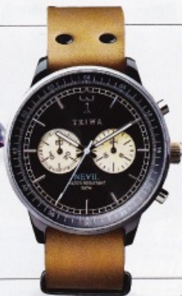
Triwa watch, $349.