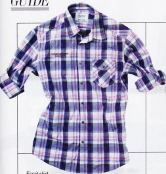
Esprit shirt, $79.95.