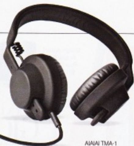
AIAIAI TMA-1 DJ headphones, $270, from Safari Living.