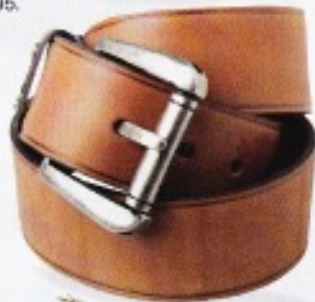
RM Williams belt, $69.95.