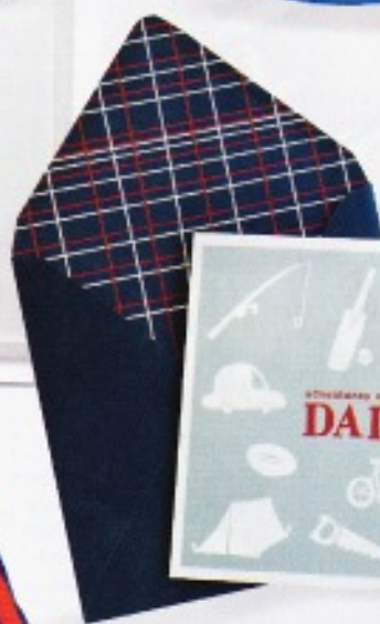
KikiK card, $5.95.