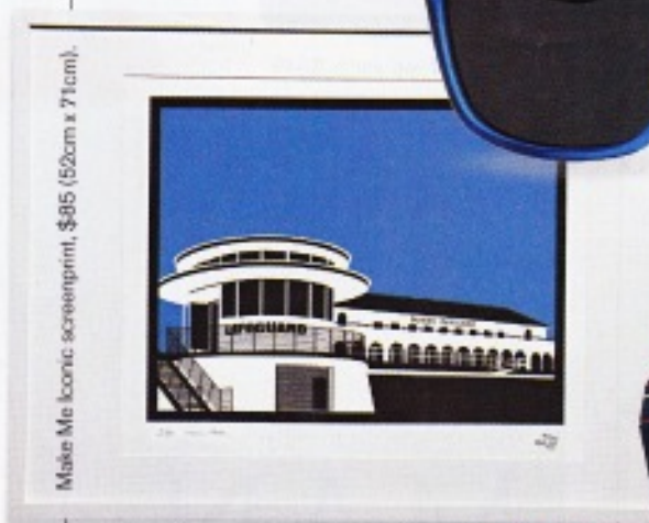
Make Me Iconic screenprint, $95 (50cm x 71cm).