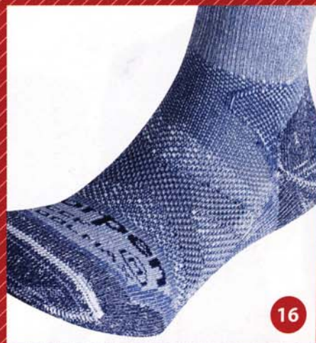
09. Moshi BassBurger portable speaker, $49.95 www.lomis.com.au 10. Kathmandu Foldable Cutlery set, $19.90 www.kathmandu.com.au 11. Let My People Go Surfing book, by Yvon Chouinard, $39.95 (03) 5261 4420 12. Exped Air Pillow, $49.95 www.intertrek.com.au 13. Silva Ranger 3 compass, $49.95 www.silva.se 14. SunnyLIFE beach paddles, $19.95 www.sunnylife.com.au 15. Inka 'write anywhere' pen, $19.90 www.zenimports.com.au 16. Sherpa Lorpen Coolmax trekking socks, $42.95 www.sherpa.com.au