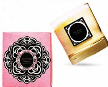
Mrs Press soy wax candle in Tea Rose, $55.