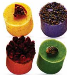
Bon Savon handmade soap set in (clockwise from top left) Lemon Myrtle, Calming Lavender, Refreshing Mint and Country Rose, $35.