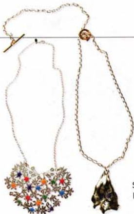
Polli stainless-steel/sterling-silver necklace, $179.95 (left); Lucy Folk sterling-silver/gold/sapphire necklace, $1250.