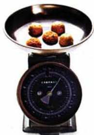
Byron Bay Cookie Company gluten and wheat free cookies, $9.95 (150g); Cabanaz metal cooking scales, $89.95, from Outliving.