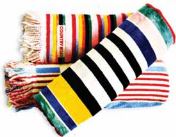
Country Road cotton towel, $39.95; SunnyLIFE cotton towels, $59.95 (front), and $69.95.