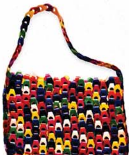
Gorman leather weave bag, $269.