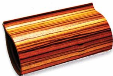
Tivi wood/leather clutch, $389.95, from Polli.