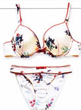
Bendon silk cotton bra, $59.95, and briefs, $29.95.