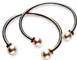
Kailis sterling-silver/black diamond/pearl cuffs, $790 (small) and $890 (medium).