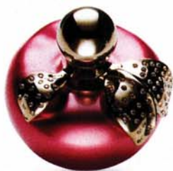
Precious Edition EDP by Nina Ricci, $100 (80ml).