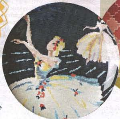
Ballerina plate, $14 from Douglas & Hope