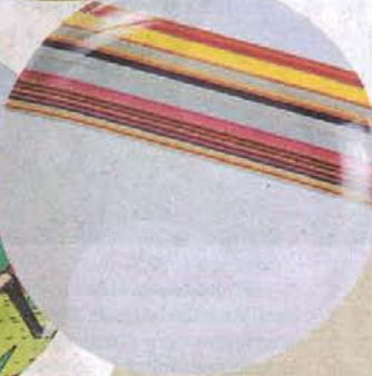
LUXE FOR LESS