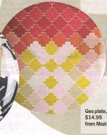
Geo plate, $14.95 from Mozi