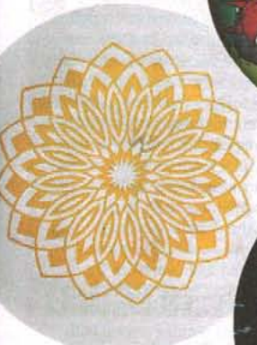
Waratah side plate, $8.95 from SunnyLife