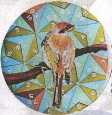
Retro Bird plate, $13 from In The Bag