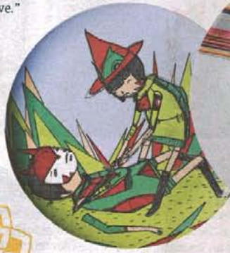
Ghostpatrol plate, $25 from Douglas & Hope