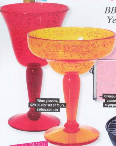
Wine glasses, $29.95 (for set of four), ezibuy.com.au

BBQ, deck chair, wine glasses ... radio esky. Yep, your summer essentials are right here.