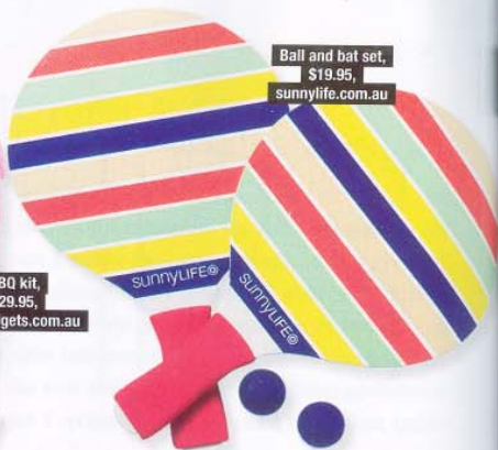
Ball and bat set, $19.95, sunnylife.com.au