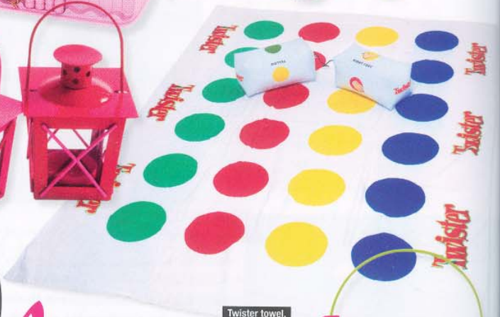
Twister towel, $59.95, giftedstore.com.au