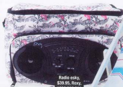
Radio esky, $39.95, Roxy, 1800 805 506