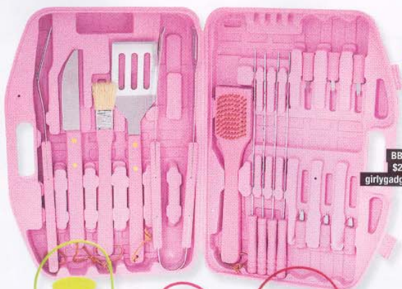
BBQ kit, $29.95, girlygadgets.com.au