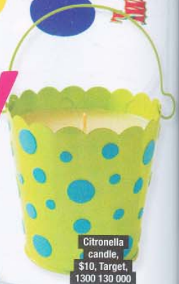
Citronella candle, $10, Target, 1300 130 000