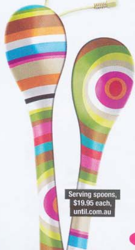
Serving spoons, $19.95 each, until.com.au