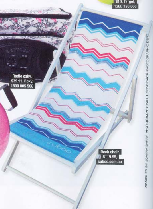
Deck chair, $119.95, suboo.com.au