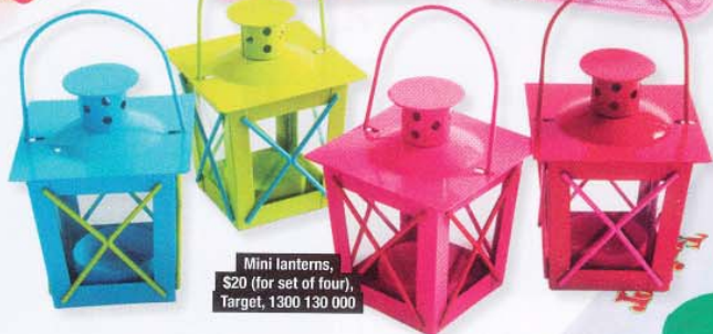
Mini lanterns, $20 (for set of four), Target, 1300 130 000