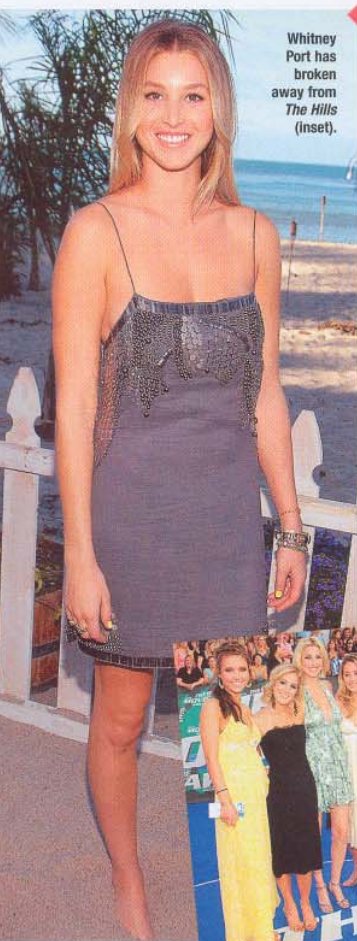
Whitney Port has broken away from The Hills (inset).

Summer is burning up with spin-off shows, cupcake books, and designer condoms.