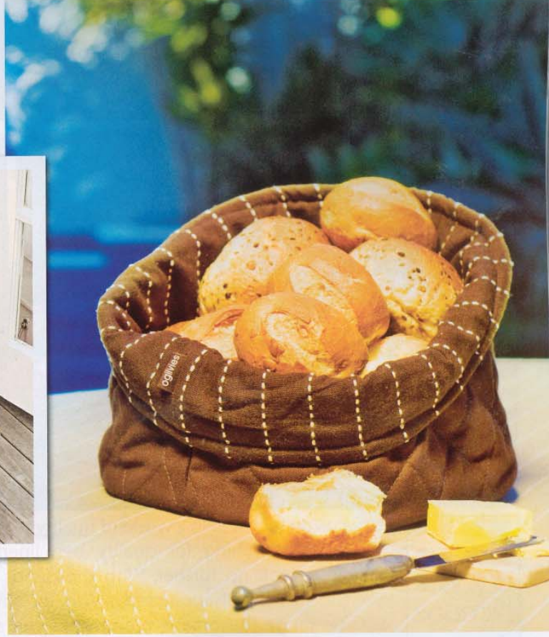
RIGHT: For a totally versatile way to serve food, check out these cotton canvas bowls from Ogilvies Designs – they're reversible and come in four different colours. Priced from $22.50.