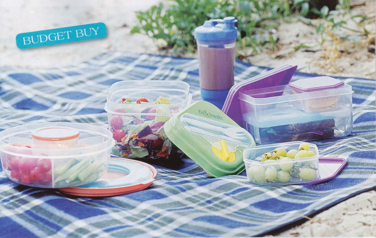
ABOVE: If you're more of a picnic person, it's important you have the perfect containers to keep food crisp and ready to go. This Fit 'n Fresh range is from Howards Storage World, from $9.95.