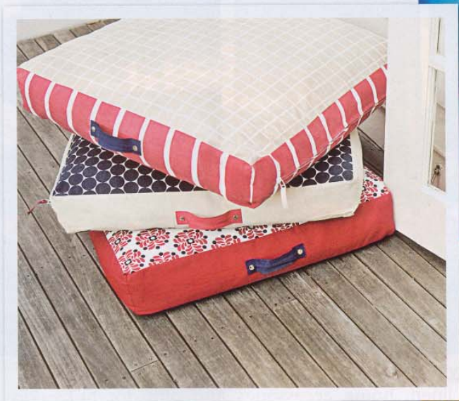
ABOVE: Make sure all your guests have somewhere comfy to sit with these Watsons floor cushions from SunnyLIFE, $79.95.