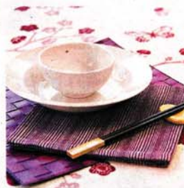
Table manners ... This range of table napery has picked up on the hottest colour and motif of the season. With its range of napkins, table runners and tablecloths in purple with a delicate floral butterfly pattern, it is an easy way to update your outdoor setting. Keiko tablecloth , $43.95, striped napkin, $6.95, and reversible table runner, $22.95, from Rapee.

Exquisite napery, deck protection and retro beach umbrellas are this week's favourites