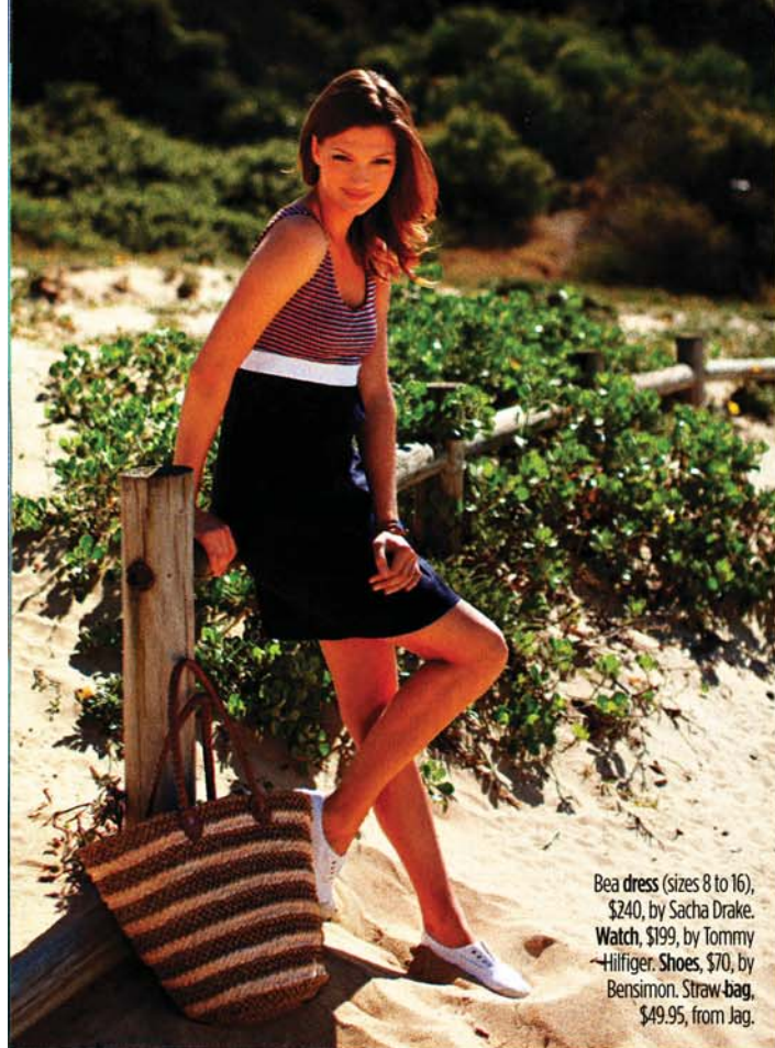
Bea dress (sizes 8 to 16), $240, by Sacha Drake. Watch, $199, by Tommy Hilfiger. Shoes, $70, by Bensimon. Straw bag, $49.95, from Jag.