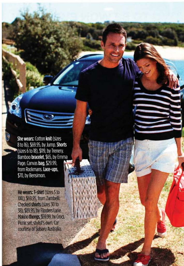
She wears: Cotton knit (sizes 8 to 16), $69.95, by Jump. Shorts (sizes 6 to 18), $119, by Trenergy. Bamboo bracelet, $65, by Emma Page. Canvas bag, $29.99, from Rockmans. Lace-ups, $70, by Bensimon.