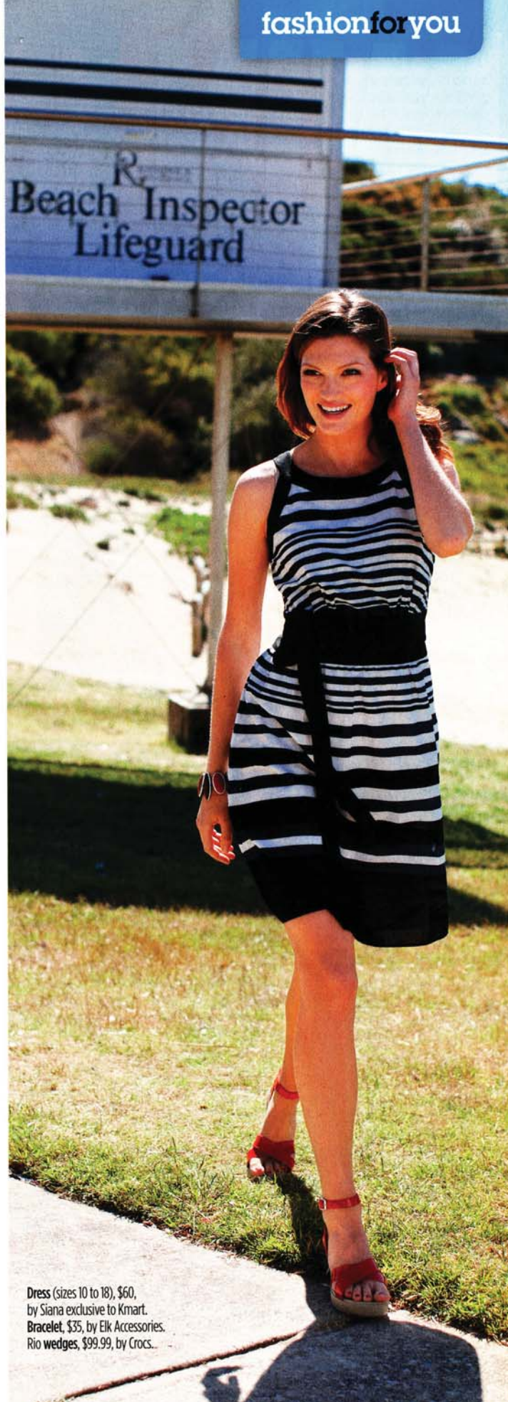
Dress (sizes 10 to 18), $60, by Siana exclusive to Kmart. Bracelet, $35, by Elk Accessories. Rio wedges, $99.99, by Crocs.