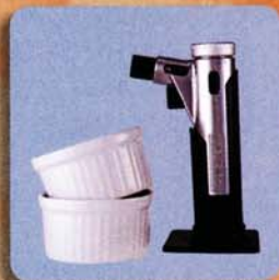
Blast it For avid chefs and fans of "burnt cream". Crême brûlée torch set with 6 ramekins and butane gas canister, $89.95, Cuisinart.