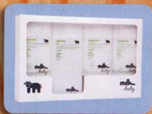
Best for bubba With gentle, natural ingredients. Baby skincare pack with bath wash, two room sprays and massage oil, $79.95, Milk Baby.