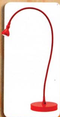
Bendy arm The diode light saves energy. Great as a bedside or task light. Jansjö table lamp, $59, Ikea.