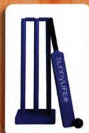
Howzat! Great for fun on the sand. Comes with a carrybag. Beach cricket , $49.95, SunnyLIFE.