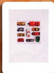
Traffic jam Designed to fit an Ikea "Ribba" frame. Arthur's Circus print in Toy Cars 3 (20cm x 25cm), $75, Lark.