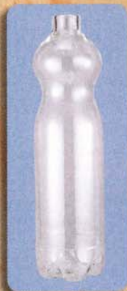
Clearly cool How novel – glass that looks like plastic. Estelico Quotidiano bottle , $60, Seletti.