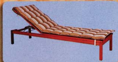
Lie back and relax The perfect spot for an afternoon by the pool. Patio By Jamie Durie sunlounger with rear wheels, $198 including cushion, Big W.