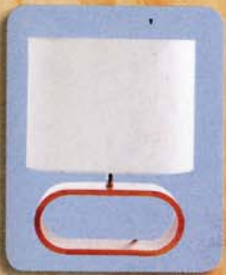
See the light Help furnish a sparse apartment with a stylish lamp. Capri table lamp, $79, Freedom.