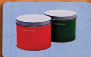
Sugar 'n' spice These bikkies are delicious and beautifully packaged to boot. Assorted sweet and cheese biscuits, $19.95 each (300g), Country Road.