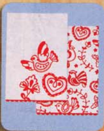
Arriba! Get into the festive spirit, in Mexican style. Fiesta de Mozi tea towel. $22.95 for set of 2 different designs, Mozi.