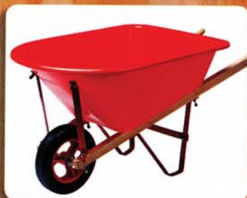
Off to work Get the children outdoors... and doing some work to boot! Kids wheelbarrow in Fire Engine Red, $39.99, Mitre 10.