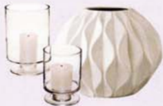
Cool ceramics Corso ceramic vessel in Cream, $49.95, Freedom Furniture.