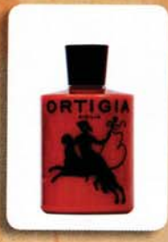
Bathroom bliss Spoil someone with luxe Sicilian toiletries. Ortigia "Corallo" shower gel, from $34, Spence & Lyda.