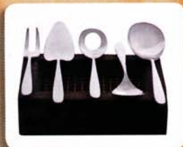
Classic cutlery Simple and stylish; made from stainless steel. Alaska 5-piece serving set in Satin, $99.95, Tablekraft.