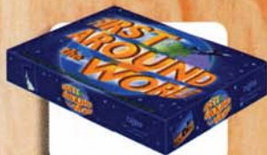
Travel bug Test your world knowledge. First Around the World board game , $59.95, Reader's Digest.