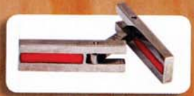
Glassy cufflinks Won't tarnish or show smudges. Titanium rectangular "Flatlinks", $99.50, Dedeceplus.