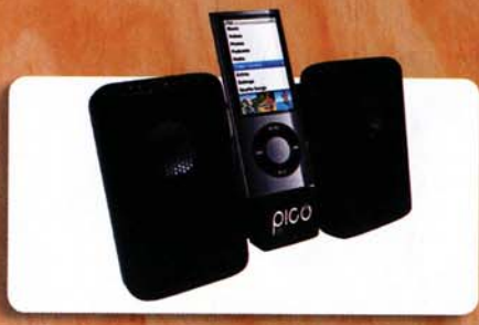
Docking sequence Compact and stylish, for music on the go. Takes four AAA batteries. Pico swivel MP3 speakers (iPod not included), $27.88, Officeworks.