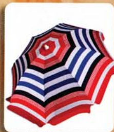
Keep your cool A useful summer accessory that looks great. Bermuda beach umbrella, $79.95, SunnyLIFE.