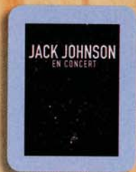
Movies & music A film following Jack through his European tour. Jack Johnson En Concert DVD (Brushfire Records), $29.95, Getmusic.com.au