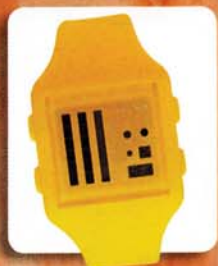
Brain teaser Waterproof and unisex – a quirky way to tell the time. Nooka ZUB 20 watch with Zen V face, $195, Dedeceplus.com