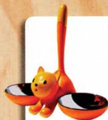
Meow! For cat lovers, a fun and practical way to feed Puss. Alessi "Tigrino" cat bowl , $129, Form + Design.