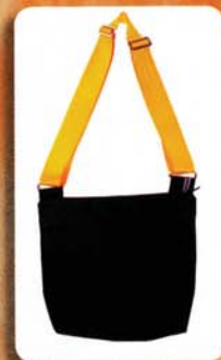
Belt up This bag comes with two interchangeable straps. Bobeff Zipper shoulder bag , $135, Matt.