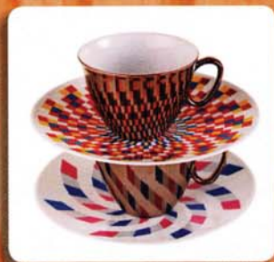
Reflect with a cuppa Mirror-like teacups reflect the designs of the saucer below. D-Bros cup & saucer sets , $80 each, Dedeceplus.com