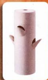
Quirky blooms A great vase for single-stem flowers. PS Stock vase , $49.99, Ikea.