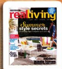
SUBSCRIBE! A whole year of creative ideas, beautiful homes and delicious recipes. Subscription for 12 issues of real living , $54.95, magshop.com.au