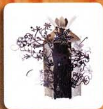
DIY This flat-packed gift cleverly turns an empty jar into a vase or tealight cover. Artecna "Thinking Of You" vase , $55, Dedeceplus.com