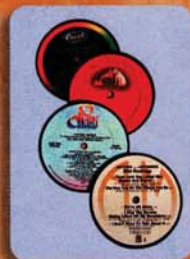
Spin right round Music lovers unite: coasters made from real LP labels. Vintage record coasters , $29.95 for 4, Outliving.