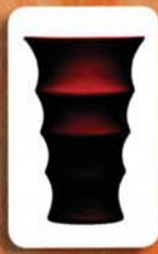
Out of... Denmark But inspired by Africa. Holmegaard "Karen Blixen" vase , $150, Jarass.