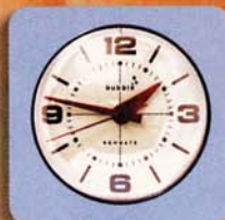
Time dome Has a very prominent round glass face. "Bubble" clock , $169, Outliving.