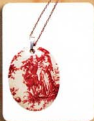
Toile fancy Sweet ceramic necklace. Oval pendant (chain not included), $19.95, Robert Gordon Australia.