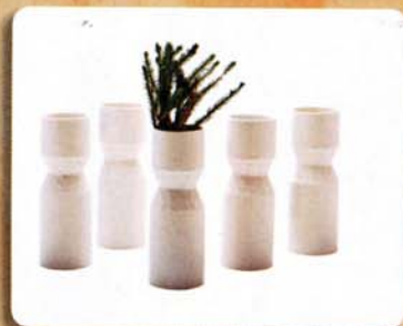
Can't ig-gnaw For those who enjoy a bit of interior humour. Paige Russell "Bad Beaver" vases, $90 each, One Small Room.