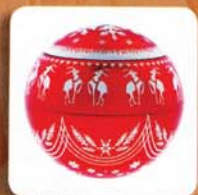
2-in-1 Yum! A bauble with chocolates inside. Reindeer bauble tin, $19.99, Lindt. →