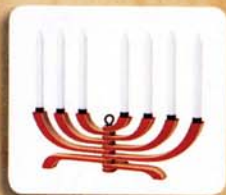
Scandi classic Red for a festive touch. Nordic seven-arm adjustable candlestick, $199, Design House Stockholm.