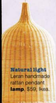
Natural light Leran handmade rattan pendant lamp . $59, Ikea.