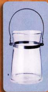
Handles well With bucket-inspired grip. PS Brunn vase , $29.99, Ikea.