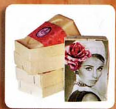
Let them eat cake Gorgeous French-inspired, boxed soaps. Les Cakes de Bertrand soaps, $25 each, Kleins Perfumery.