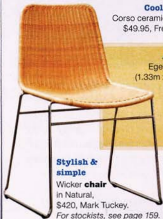
Stylish & simple Wicker chair in Natural, $420, Mark Tuckey. For stockists, see page 159.