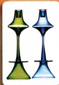
Multip-tasking Designer candleholder or bud vase. Gaia & Gino "Arim" vases , $150 each, Dedeceplus.com