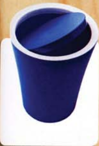
Flip out Yes, when a bin is stylish you can give it as a gift. Flip bin, $29.95, Outliving.