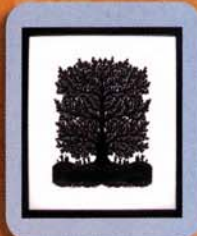
Paper cuts Whimsical art made from cut paper. Music Tree artwork $149 in bamboo frame (39.5cm x 48.5cm), Hardwick & Cesko. For stockists, see page 159. ❶