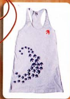
Dress it up Cute and casual. Odd One Out dress, $55, Two Ruffians.