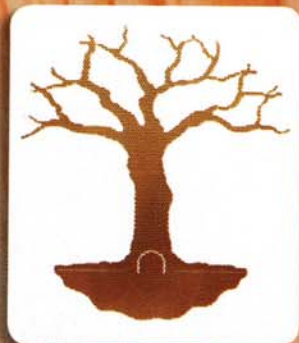
Branch out Help get things organised. DesignByThem "Treeling" jewellery hanger, $89, Top3 By Design.