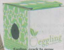
Egging, crack to grow fresh herbs, $20.65, Vanilla Gifts, South Fremantle.

Little Green Book of Gardening, by Diane Mills (Carlton Books, $16.95), 250 tips for an eco lifestyle. Written for the British market but still most tips apply. Art Gallery of WA shop.