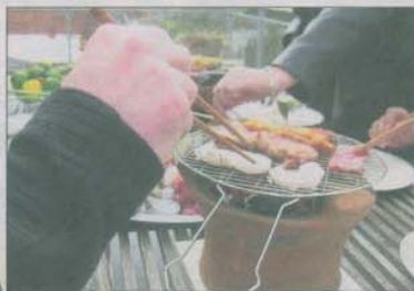
Tabletop barbecue with grill, three sauce dishes and four pairs of chopsticks, $30 plus post, www.tabletopbbq.com .