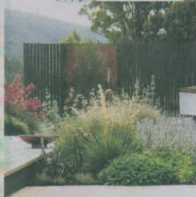
Contemporary Australian Garden Design School of Landscaping garden design course JOHN PATRICK AND JENNY WADE