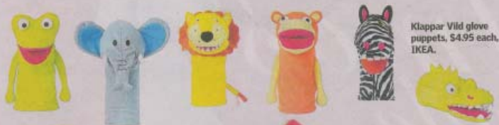
Klappar Wild glove puppets, $4.95 each, IKEA.

Search no more. Finding a great present is child's play.