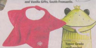
NICI Rock Star bib, $17.95, designed by Bon Jovi drummer Tico Torres, 1300 881 940.