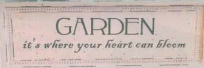
Garden plaque, $32.95, Complete Garden.

Fill your garden with little extras that will be a talking point when guests arrive