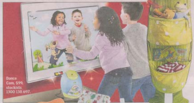
Dance Cam, $99, stockists 1300 138 697.