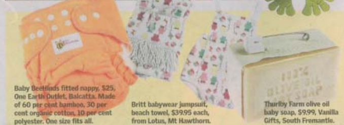
Baby Beethinds fitted nappy, $25, One Earth Outlet, Balcatta. Made of 60 per cent bamboo, 30 per cent organic cotton, 10 per cent polyester. One size fits all.