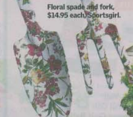
Floral spade and fork, $14.95 each, Sportsgirl.