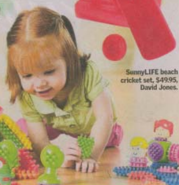
SunnyLIFE beach cricket set, $49.95, David Jones.