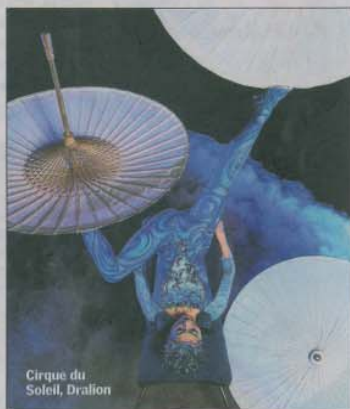
Cirque du Soleil, Dralion