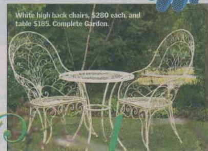
White high back chairs, $280 each, and table $185, Complete Garden.