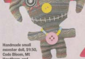
Handmade small monster doll, $9.50, Code Bloom, Mt Hawthorn, and Vanilla Gifts, South Fremantle.