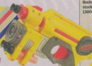
Nerf Nite Finder, $14.95, stockists 1300 138 697.