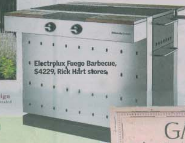
Electrux Fuego Barbecue, $4229, Rick Hart stores.

Fill your garden with little extras that will be a talking point when guests arrive