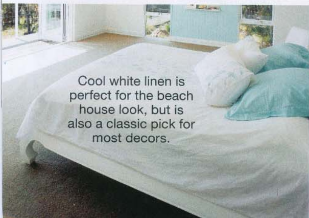
Cool white linen is perfect for the beach house look, but is also a classic pick for most decors.