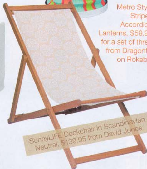
SunnyLIFE Deckchair in Scandinavian Neutral, $139.95 from David Jones