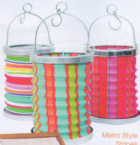
Metro Style Stripes Accordion Lanterns, $59.95 for a set of three from Dragonfly on Rokeby.