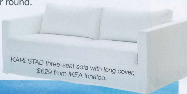
KARLSTAD three-seat sofa with long cover, $629 from IKEA Innaloo.

Take inspiration from Ana and Peter's beach house and feel like you are on summer vacation all year round.