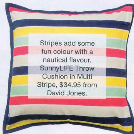
Stripes add some fun colour with a nautical flavour. SunnyLIFE Throw Cushion in Multi Stripe, $34.95 from David Jones.