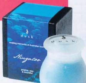
Bring the essence of the beach into your home with a coastal-inspired fragrance. Ningaloo candle from Dusk.