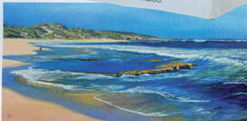
Not lucky enough to have an ocean view? Invest in a piece of art to make you feel like you're there. Towards Yallingup by Gary Lethendale, 760 x 1360 oil on canvas, $3500 from Gallery 360.