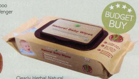
Clearly Herbal Natural Baby Wipes from Nordic Nappies