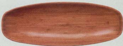
Bamboo platter from SunnyLIFE