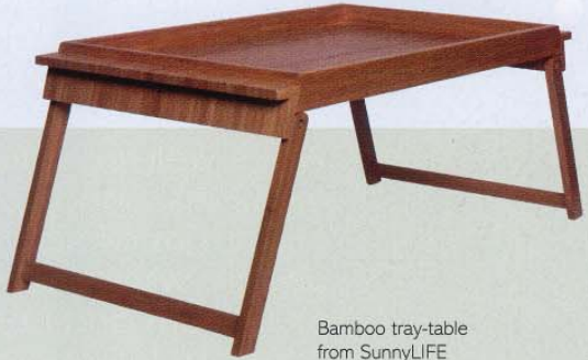
Bamboo tray-table from SunnyLIFE