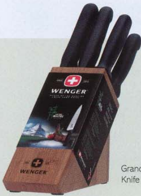
Grand Maître Bamboo Knife Block from Wenger

So, next time you go shopping, make the right choice. There's a wide range of products on the market which utilise bamboo, and we hope to see many more in the not-too-distant future. Remember, the more popular these products become, the more bamboo will be planted, and the greener the world will be!