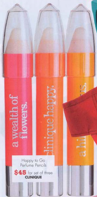
Happy to Go Perfume Pencils $45 for set of three CLINIQUE

Brighten up an action girl's Chrissie with fun gym gear and outdoor accessories!