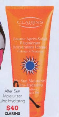
After Sun Moisturizer Ultra-Hydrating $40 CLARINS