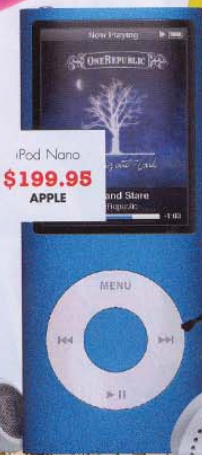
iPod Nano $199.95 APPLE