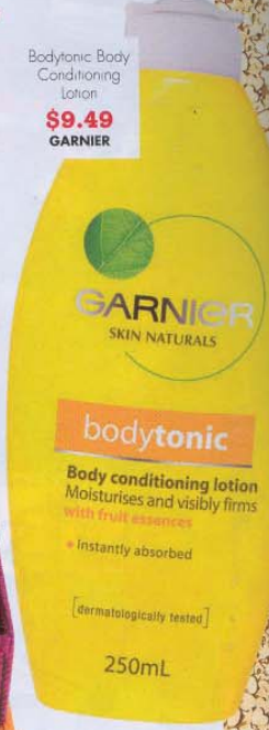
Bodytonic Body Conditioning Lotion $9.49 GARNIER