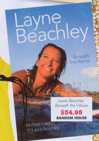
Layne Beachley Beneath the Waves $34.95 RANDOM HOUSE