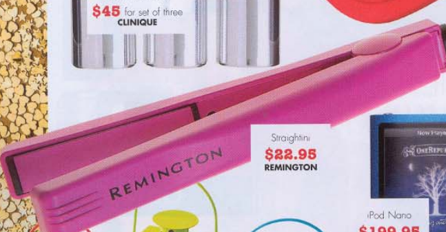
Straightini $22.95 REMINGTON