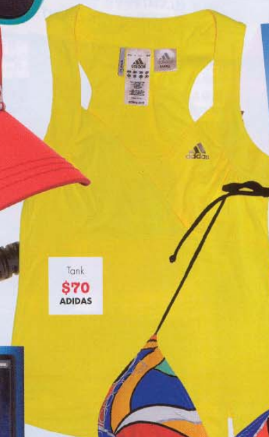
Tank $70 ADIDAS