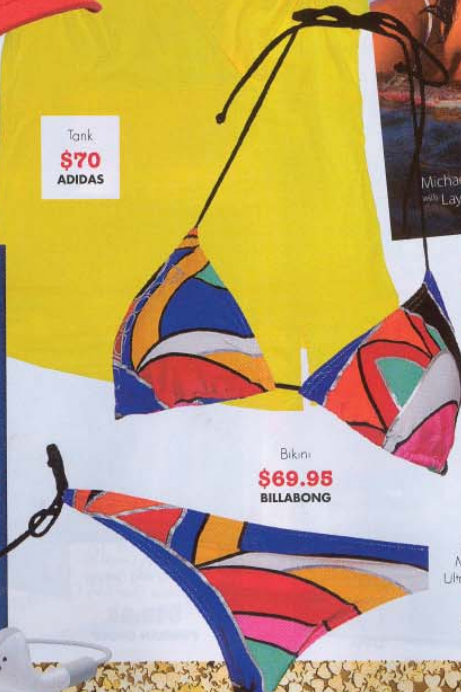
Bikini $69.95 BILLABONG