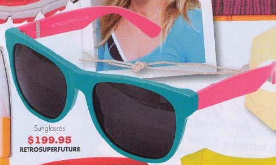
Sunglasses $199.95 RETROSUPERFUTURE