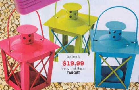
Lanterns $19.99 for set of three TARGET