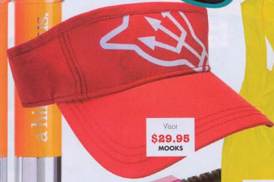
Visor $29.95 MOOKS