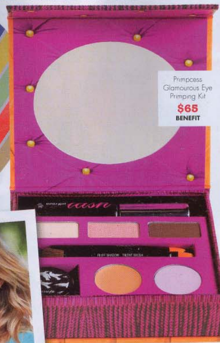
Primpess Glamorous Eye Priming Kit $65 BENEFIT