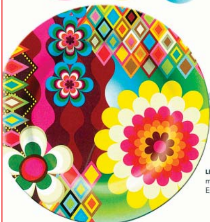
LEFT: French Bull 'Mosaic' melamine dinner plate, $14.95. Enquiries to Until.