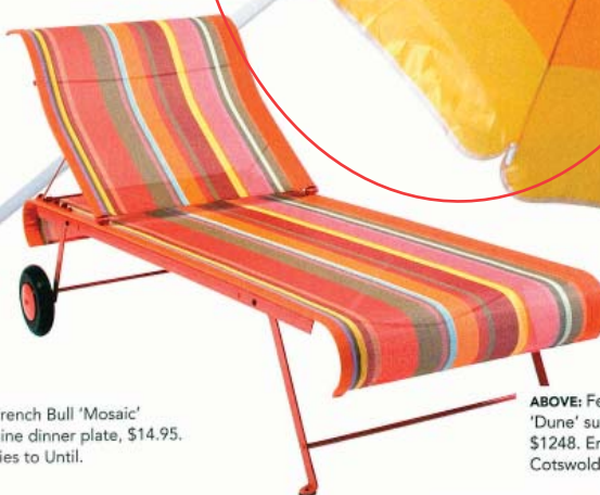
ABOVE: Fermob 'Dune' sun lounger, $1248. Enquiries to Cotswold Furniture.