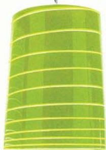
LEFT: Serralunga 'Aunt Jane' light by Marc Sadler, POA, from Space Furniture.