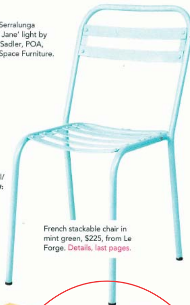
French stackable chair in mint green, $225, from Le Forge. Details, last pages.