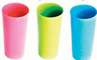
LEFT: Coza 'Conic' unbreakable glasses in Pink, Green and Blue, $3.95 each. Enquiries to Until.

Outdoor living means taking to nature with fine furniture and comforts.