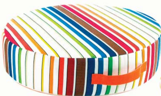
ABOVE LEFT: Korban/Flaubert 'Swell' stool/ side table in Light Blue 325, $200. BELOW: Missoni Home 'Tuilleries' round floor cushion, $700, from Spence & Lyda.