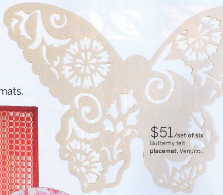
$51 /set of six Butterfly felt placemat, Venucci.