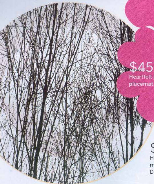
$45 /set of six Heartfelt felt placemat, Venucci.