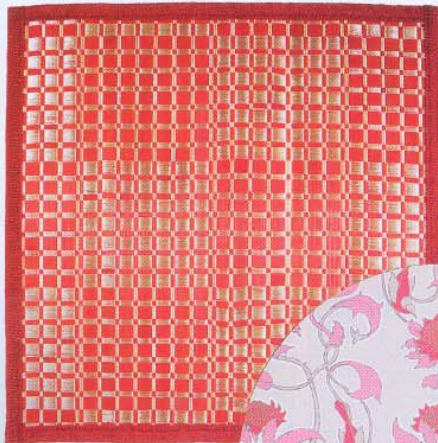
$7 Gotham bamboo and polyester placemat, Rapee.