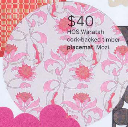
$40 HOS Waratah cork-backed timber placemat, Mozi.